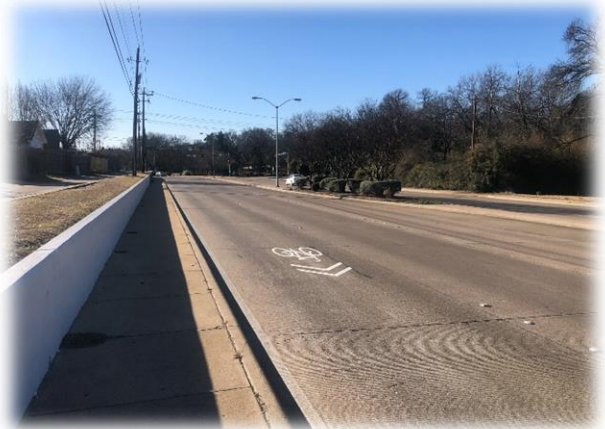
Left to right: Aerial view of Lakeside Park; Shared lane markings at Cockrell Hill Road.