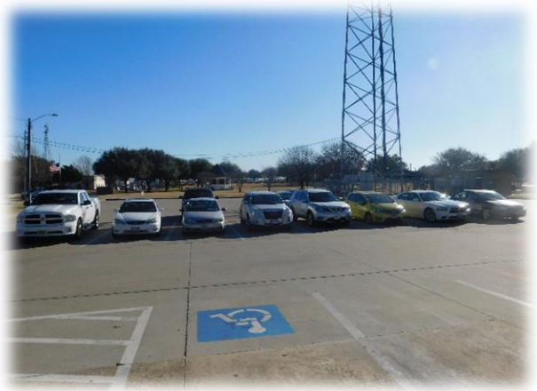
From left to right: Curbside meals at D.L. Hopkins Jr. Senior Center; Parking Lot Bingo participants