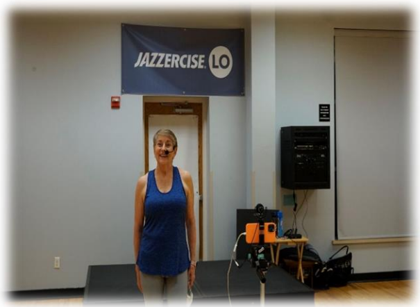
From left: i9 Sports Class; Jazzercise class.