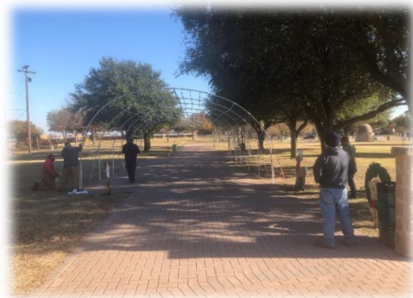
Next-door post about Christmas Stroll; Staff finishing up Christmas Stroll at Armstrong Park