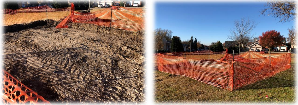
Equipment installation at Pyburn Park