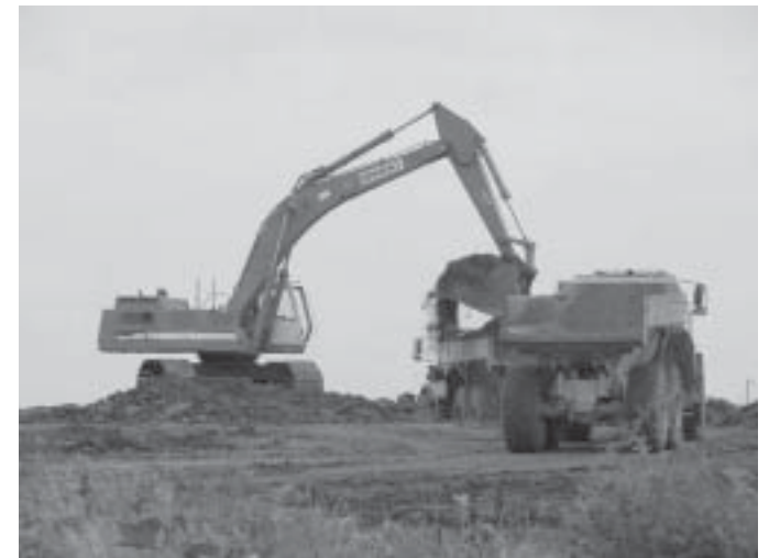
Construction has begun on the projects approved in the October 2001 bond election. Pictured is the initial site work for one of two new elementary schools. This is the site for the C.J. and Anne Hyman Elementary located in the Mt. Creek area of the district ( west section of the district boundaries ).

SkillsUSA-VICA is the national organization for students in trade, industrial, technical, and health occupations education. It sponsors the SkillsUSA championships annually to recognize the achievements of vocational students and to encourage them to strive for excellence and pride in their chosen occupations.